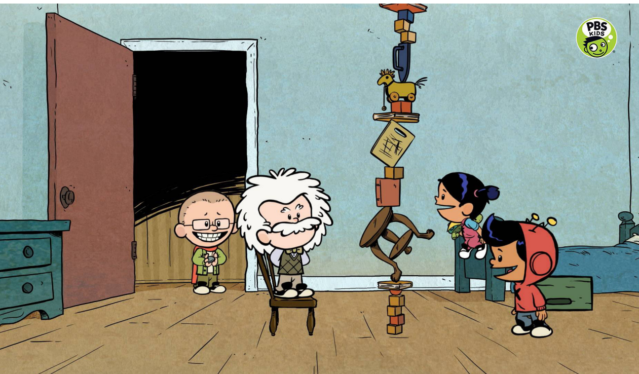
The trio from Xavier Riddle and the Secret Museum venture into the past to meet young Albert Einstein